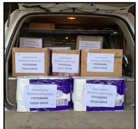
Photo of Food Drive donated items, loaded ready to be delivered to Foodbank at Kadina

Each year, the Lions Club also donate Christmas Hampers purchased from Foodbank, to Country Health Services at Minlaton. These hampers are distributed on SYP to families needing assistance at that time.