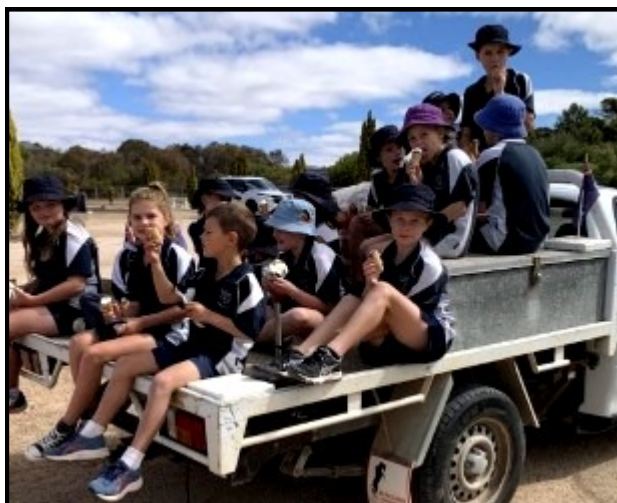
Children enjoying an ice cream after placing flags at the Stansbury cemetery.