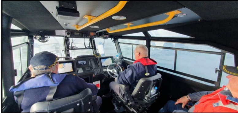
Vincent Star KI Crew